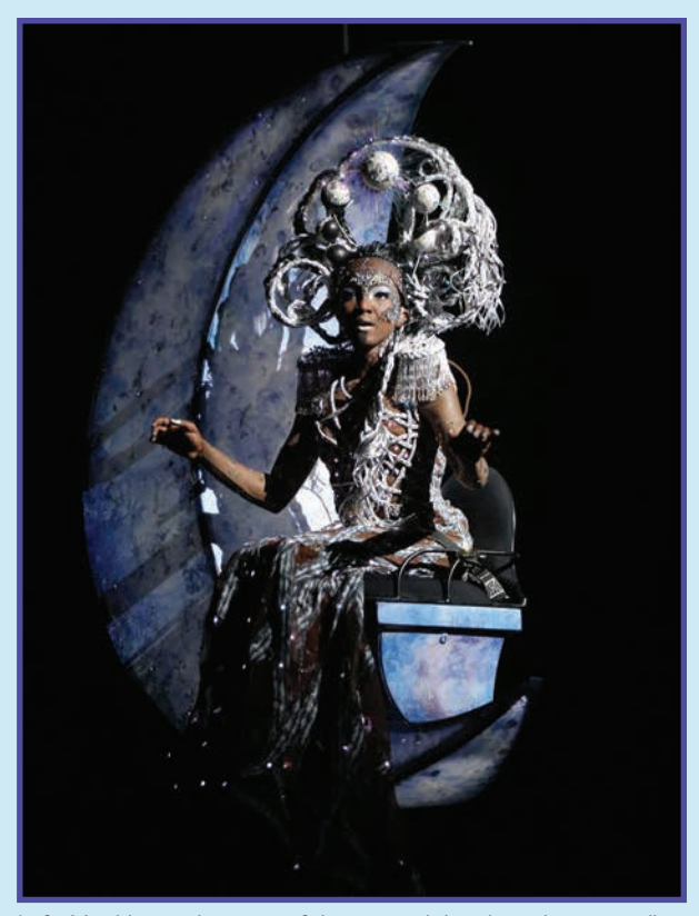
Left: Mephisto, a key part of the set and the show, is a sprawling mechanical monster composed of TVs, cameras, microphones, and tungsten bulbs. Above: Ngame, the Mother Moon.