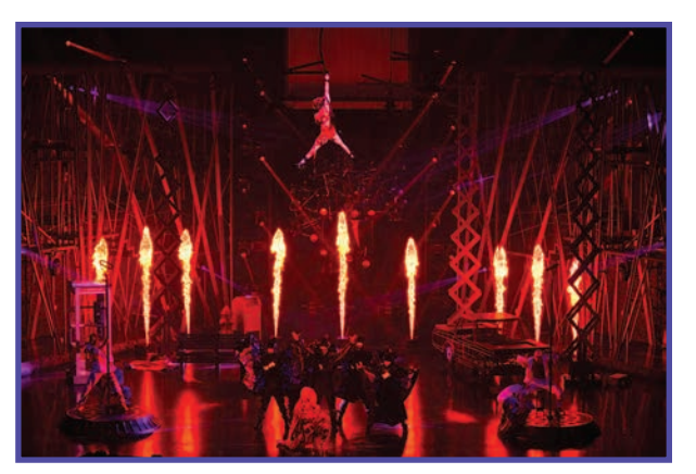
The stage also includes 66 winches, which move at speeds of up to 12' per second.

time that I had a team with this much experience. More and more, I see that MJ ONE was the result of six years of work on other shows, and it went so smoothly. We did a lot of work, but, technically, it was amazing."