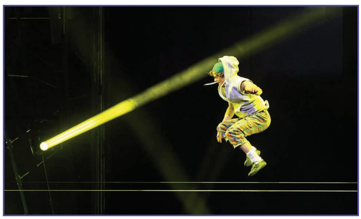
In order to create a repertory system that would support the theatricality of the performance, lighting designer David Finn included more than 100 Clay Paky Alpha Profile 1500s as well as ten Clay Paky Alpha Profile 1200s.

perfect color, perfect dimming, everything, for this show. We have around 250 of them all throughout the set pieces, in trenches, and all over."