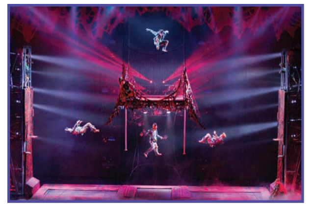
Two 96' overhead tracks have two acrobatic trolleys each for the moving artists, some of whom fly over the audience.